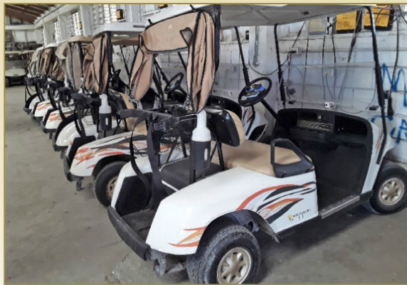
Megapower Limited in collaboration with the Barbados Golf Club has developed a way to retrofit the Club’s golf carts with used old batteries from EVs.

Megapower Limited has installed a variety of EV charging stations throughout Barbados and implemented the project reporting requirements for the installation of a 20kW wind turbine on the compound of the US Embassy in Bridgetown.