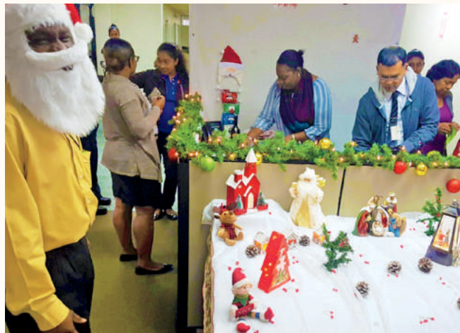
Santa was also present to bring a bit of yuletide sparkle into the office.