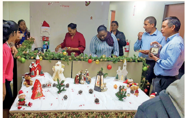
RIC staff indulge in Christmas treats at the launch of the RIC's Christmas Corner.