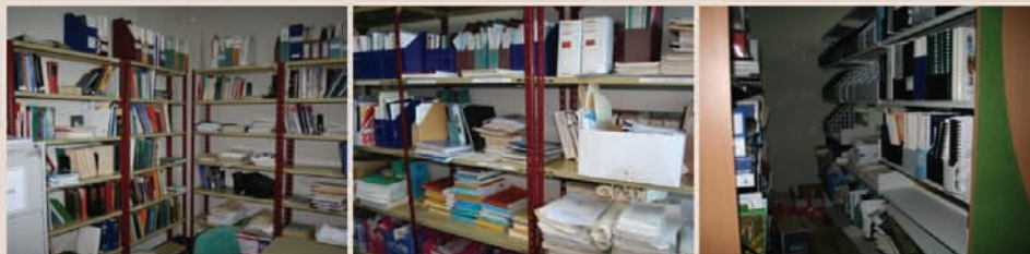
BEFORE REFURBISHMENT WORK

Moreover, the new facility offers areas for isolated focus so that distractions can be avoided and has room for those occasions when group discussions/collaboration is necessary.