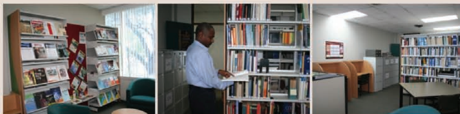
AFTER REFURBISHMENT WORK