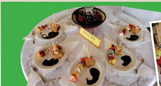
(Top) For dessert: Fruit kebabs and Cassava Pone with coffee flavoured syrup.

The RIC was among several organisations under the Ministry of Public Utilities which participated in this year's event. The cooking competition featured a special ingredient "corn" which prompted the RIC's presentation "Cornucopia" which showcased the culinary skills of the Regulated Iron Chefs (RIC).