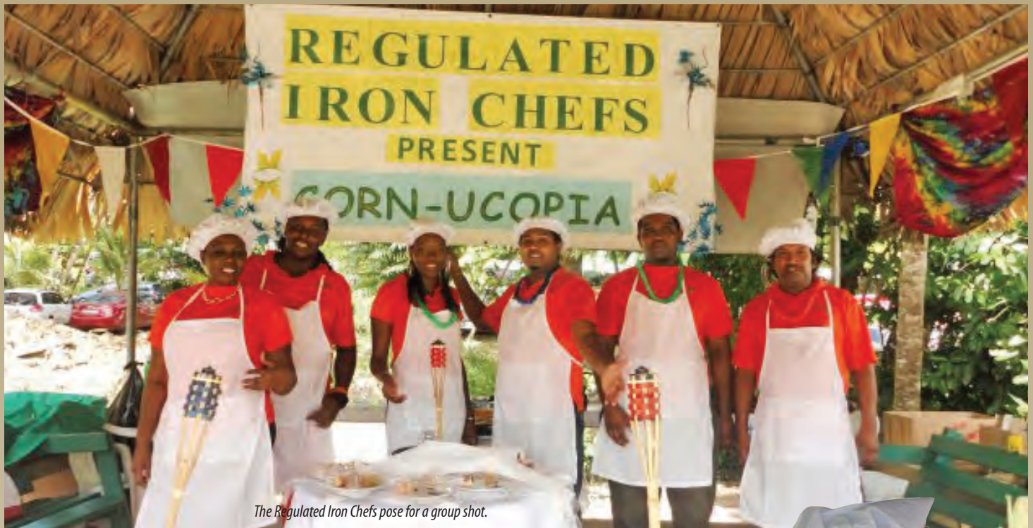
The Regulated Iron Chefs pose for a group shot.