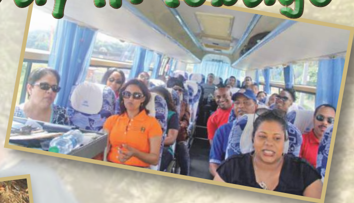
Staff enjoying the tour on our way to Argyle Waterfall.

As part of a Team Building Exercise, members of the RIC staff participated in a Fun Day which took them to a tour of Tobago on Friday 28th November, 2014. The day included a visit to the popular tourist attraction, the Argyle Waterfall which is located just outside Roxborough, on the Scarborough Road, lunch at the critically acclaimed Blue Crab Restaurant in Scarborough and the world famous Pigeon Point Beach and Heritage Park.