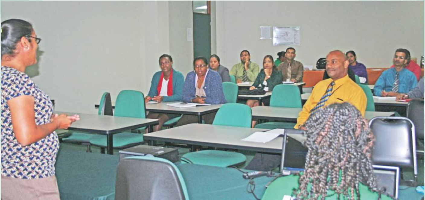
RIC staff attends Mental Health Session facilitated by the North West Regional Health Authority.

In 2014, the Regulated Industries Commission's Health and Safety Committee continued to work towards ensuring that the RIC was compliant with the provisions of the Occupational Safety and Health Act (2004) (OSH Act) and also that staff was trained in different aspects of Health and Safety (H&S) throughout the year. A Gap Analysis of the status of the RIC's shortcomings with respect to H&S was done by an independent consultant in November 2013 and this report served as a guide for setting the Committee's agenda in 2014, as action was taken to address the issues presented within the report.