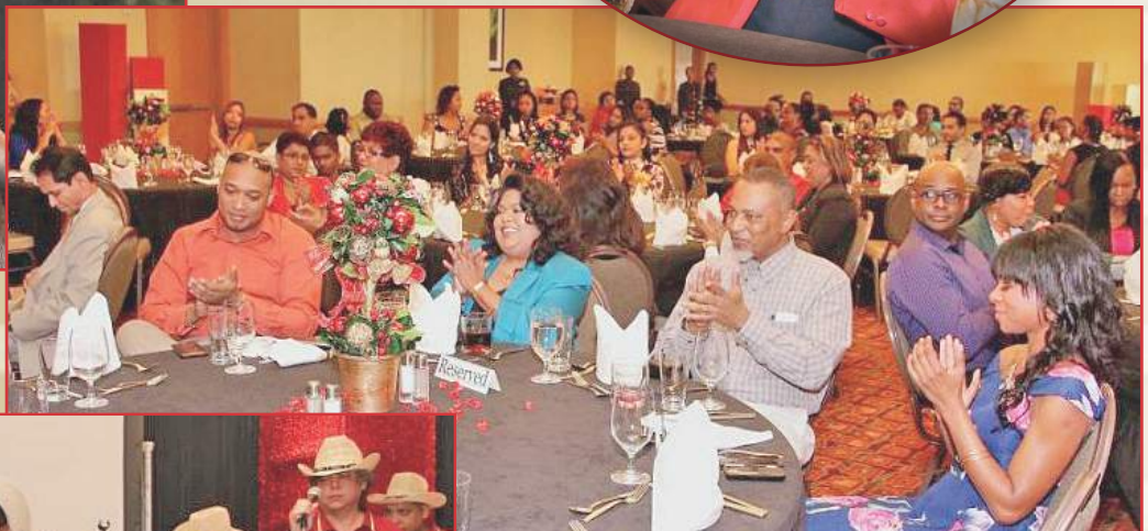
(Photo, above): Our guests getting ready for another entertaining performance.