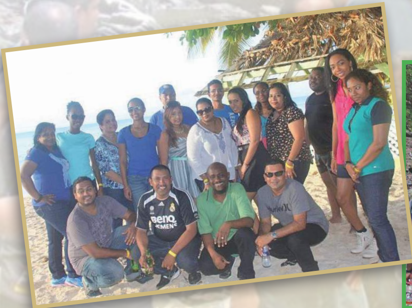
RIC staff pose for a picture on Pigeon Point Beach.