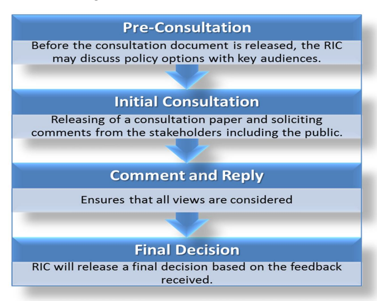
Figure 3: RIC's Consultative Process

RIC's four stage Consultative Process is shown in figure 3.