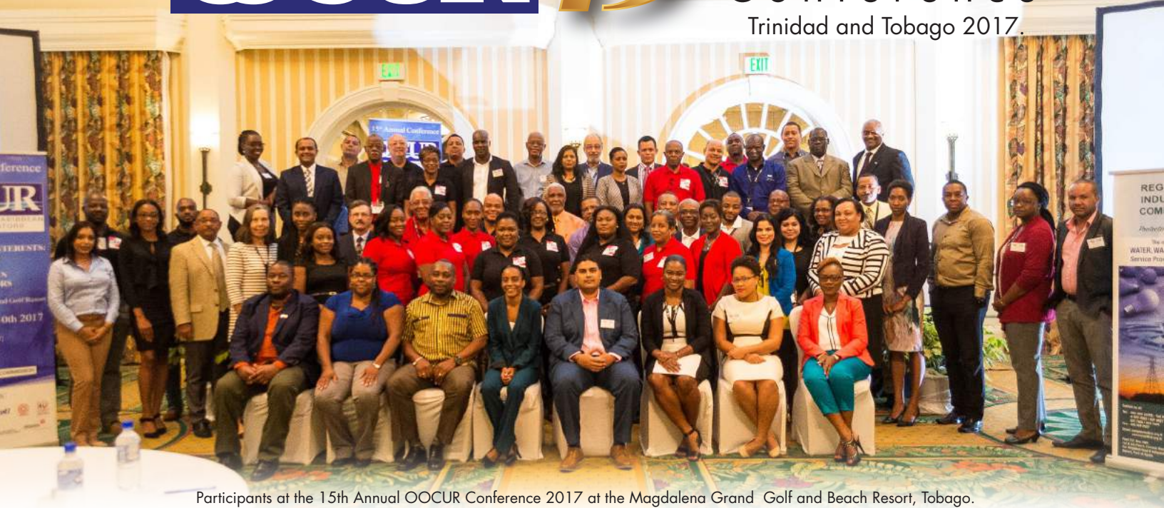
Participants at the 15th Annual OOCUR Conference 2017 at the Magdalena Grand Golf and Beach Resort, Tobago.

The Regulated Industries Commission (RIC), Trinidad and Tobago in collaboration with OOCUR hosted the 15th Annual Conference of the Organization of Caribbean Utility Regulators (OOCUR) from the 8th – 10th November 2017 at the Magdalena Grand Beach & Golf Resort, Tobago.