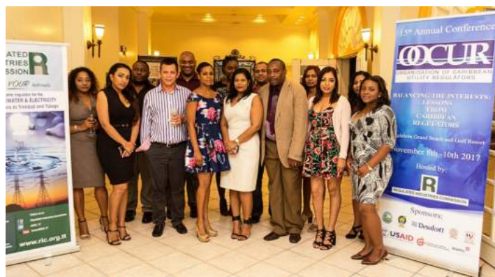
The hardworking Staff of the RIC at the OOCUR Conference Dinner

Participants, who included regulatory specialists, policy makers and academics, got an opportunity to hear and discuss the latest ideas about the theory and practice of regulation and consumer related matters in the regulatory sphere of the Water and Wastewater, Telecommunications & ICT, Electricity & Energy Sectors.