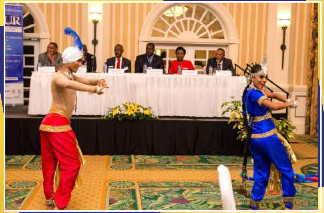
Head table looks on as the Khalnayak Academy of Dance perform during the Opening Ceremony.

The RIC, in collaboration with OOCUR hosted the 15th Annual Conference of the Organization of Caribbean Utility Regulators (OOCUR) from the 8th – 10th November 2017 at the Magdalena Grand Beach & Golf Resort, Tobago.