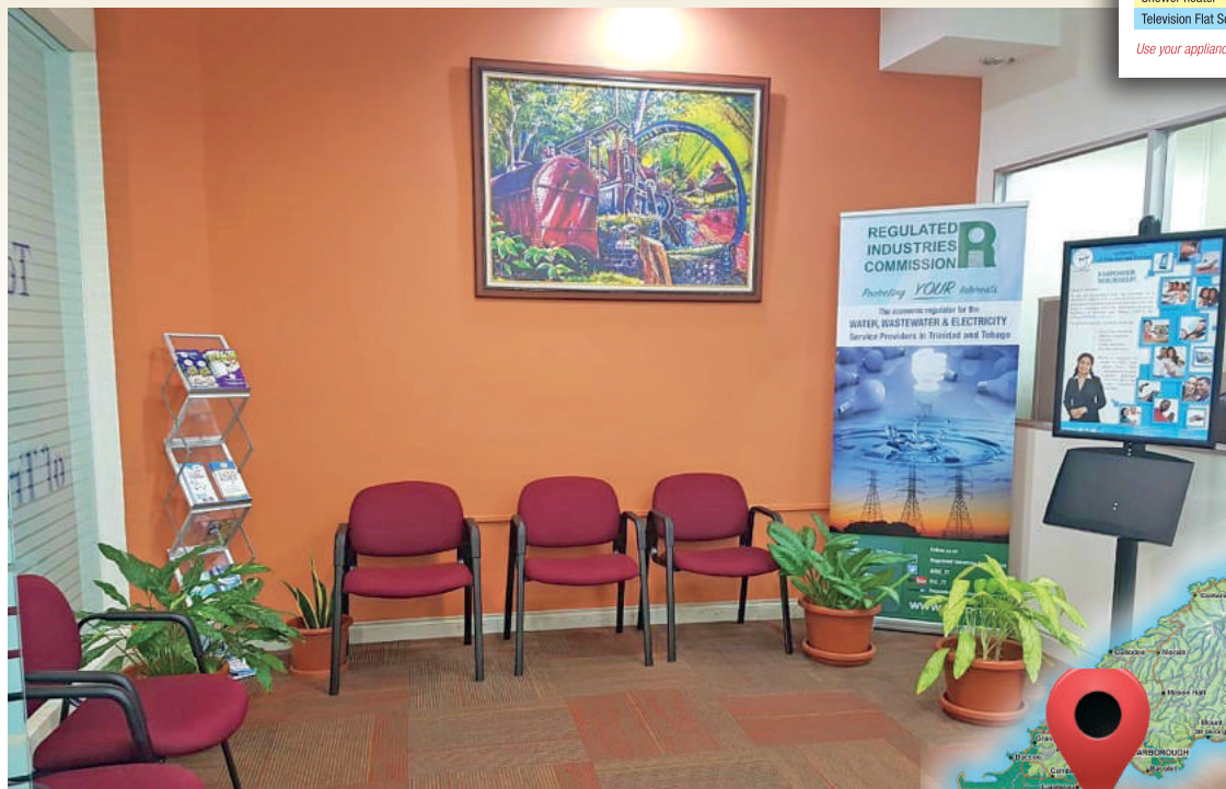
RIC Outreach held at TATT office, Lowlands, Tobago.

Look out for our next outreach in Tobago!