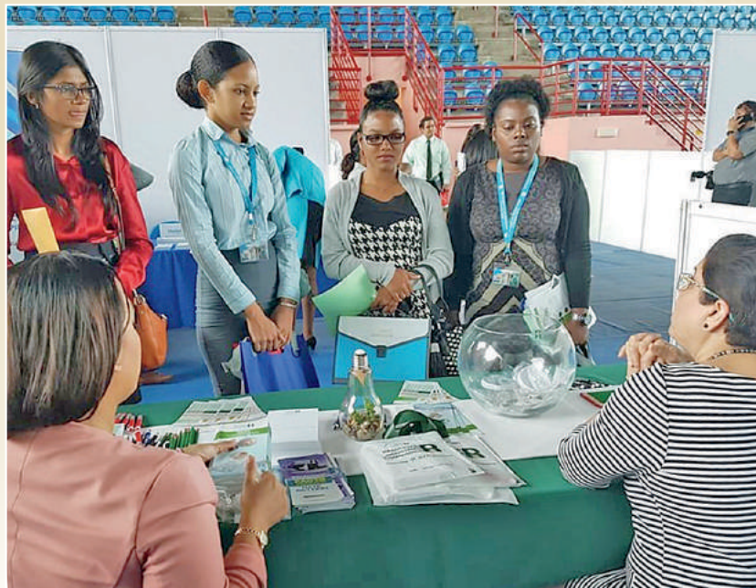
Students of the University of the West Indies at the RIC's booth.