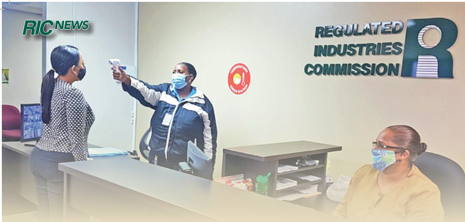
Customer having their temperature measured at the Temperature Check Station.