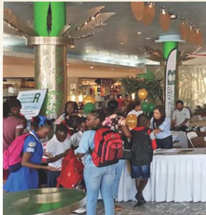
The RIC was able to interact with a group of Girl Scouts who were eager to take informational brochures back to their parents and of course get some exciting promotional items for themselves.

Four staff members from the RIC manned the booth; the Corporate Communications Manager, Corporate Communications Assistant, a Customer Service Officer and the Human Resources Assistant, all of whom interacted with the public and disseminated information through the distribution of promotional items and RIC brochures, as well as through face-to-face discussions. Visitors to the booth also had the opportunity to lodge complaints and have their questions answered by a Customer Service Officer of the RIC.